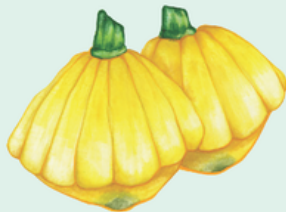
Summer Squash JULY