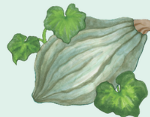
Winter Squash DECEMBER